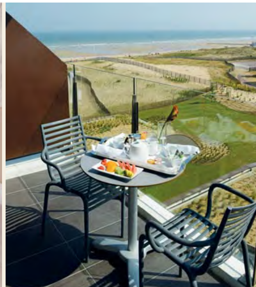
"Exclusive" room with balcony and a partial water view