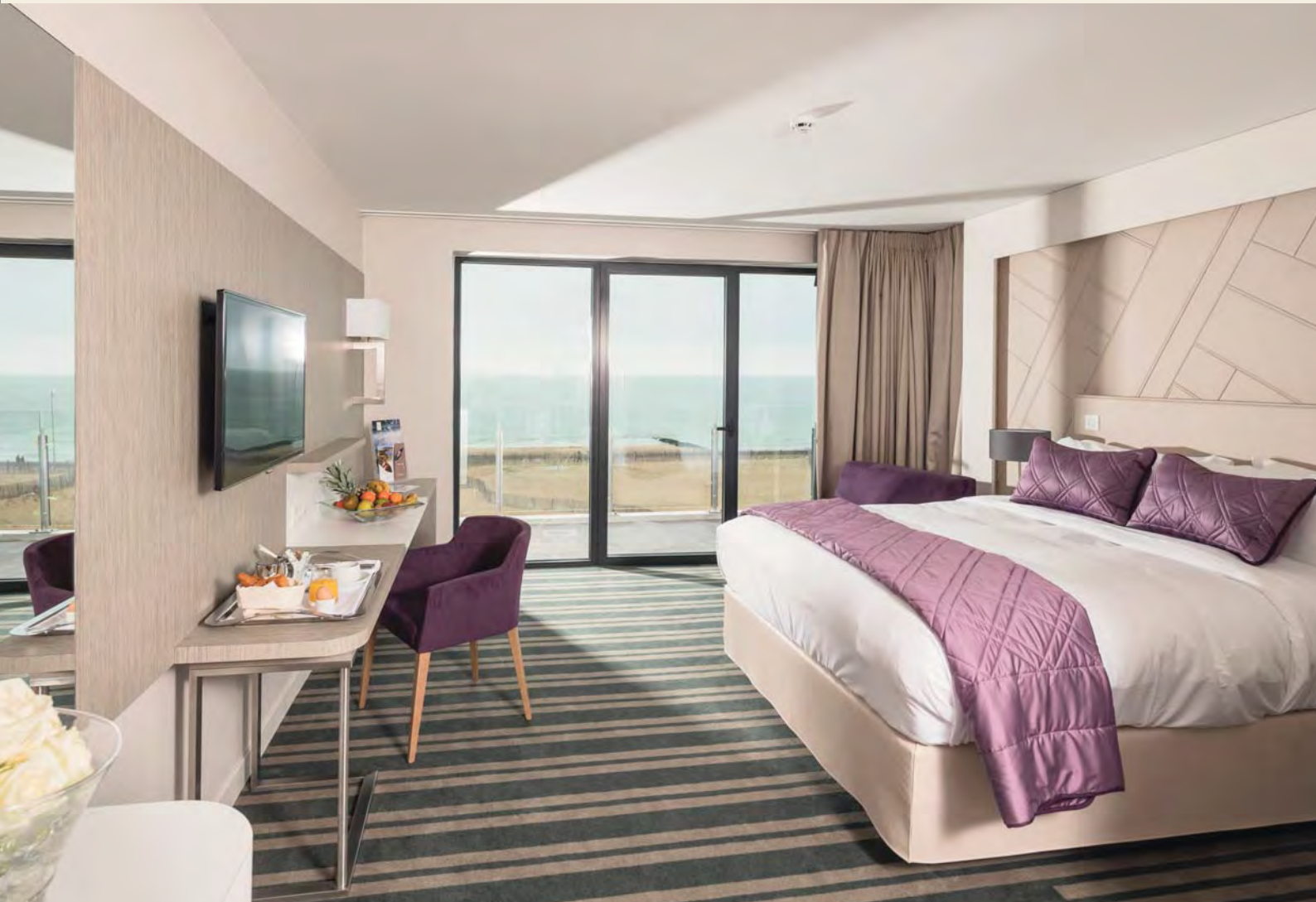
"Exclusive" room overlooking the water - "Privilege"